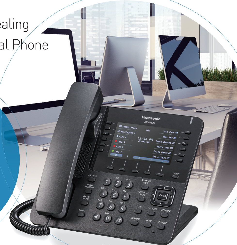
KX-DT680 Colour LCD

A digital phone that incorporates a large LCD screen with a slim design. Flexible function keys with a self-labelling feature offer the most customisation and flexibility for our customers. The large LCD screen also helps to ensure correct operation and improves usability.