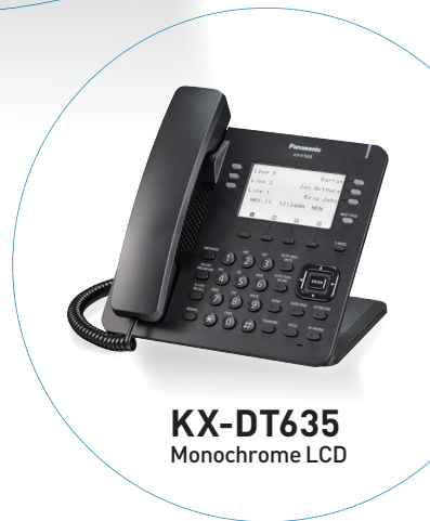
KX-DT635 Monochrome LCD

24 Flexible Function Keys (6 Keys x 4 Pages)